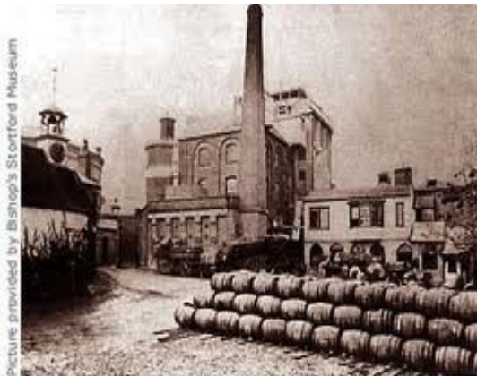
Early view of Hawkes brewery, founded in 1780

Fresh Spinach, Crumbled Bacon, Gorgonzola, Chopped Tomato, Hard Boiled Egg With A Warm Balsamic Vinaigrette