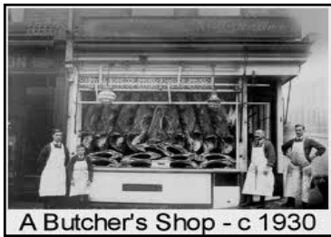
A Butcher's Shop - c 1930